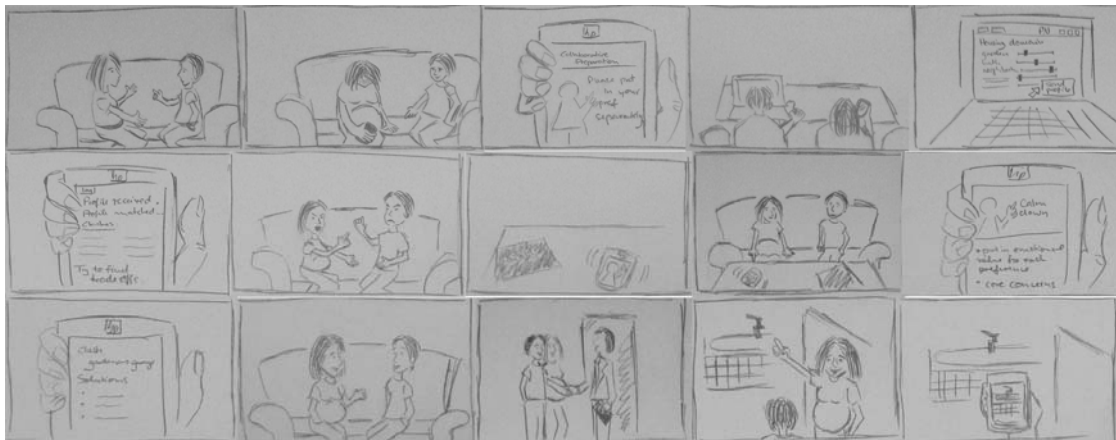
Fig. 1. Collaborative preparation scenario

Focus groups [16] have been widely used in marketing to exploit the dynamics of group discussions in order to receive attitudes towards ideas or products. Bruseberg and McDonagh-Philp [3] have shown that focus groups are also useful during the design process of new technologies. They help the participants to articulate their ideas and provide the researcher with inspiration for the design process. Lately, HCI researchers have adopted the method and refined the techniques used to stimulate the discussion. As for instance, Goodman and colleagues [7] found out, it is profitable to use visual help such as pictures and also scenarios in focus groups. Furthermore,